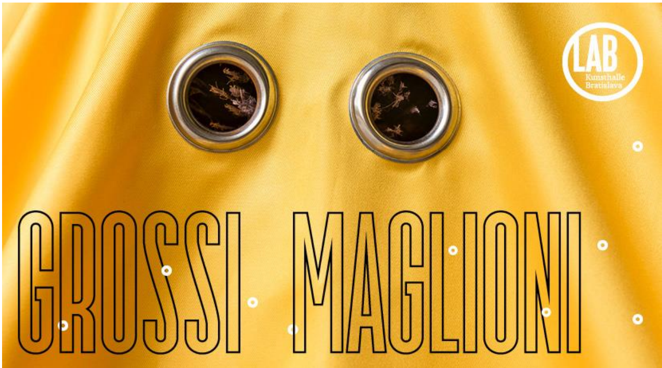
Grossi Maglioni: Occupazioni: The Split Child , 2019, pillows, textiles, iron, detail installation view at Hungarian Academy in Rome